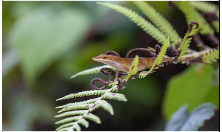
Green Anole ( Anolis carolinensis )