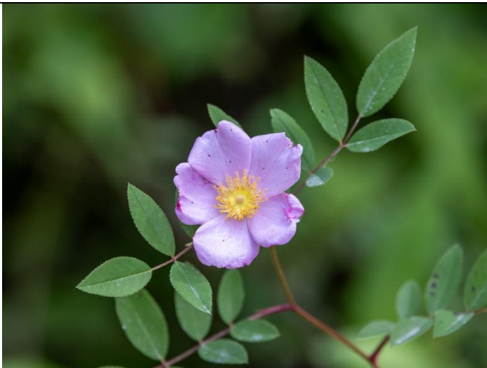
Swamp Rose ( Rosa palustris )