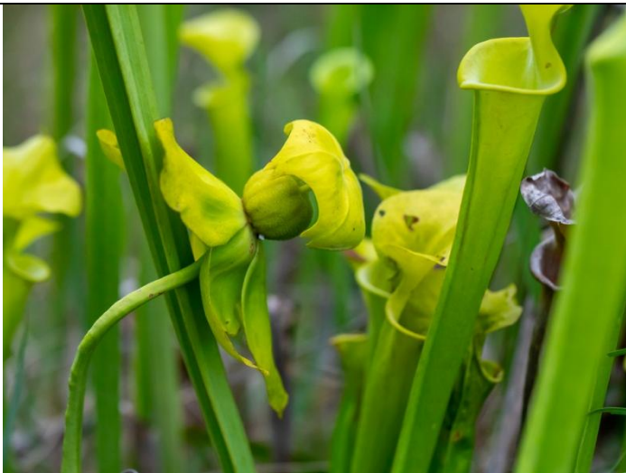
Yellow Pitcher Plant ( Sarracenia flava )