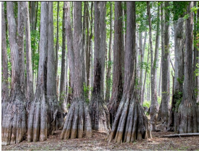
Waterlines – sans water