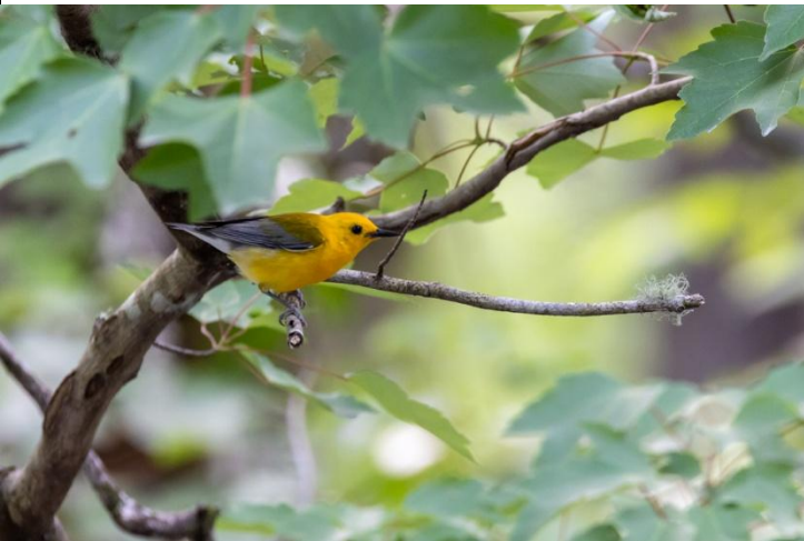
Prothonotary Warbler ( Protonotaria citrea )