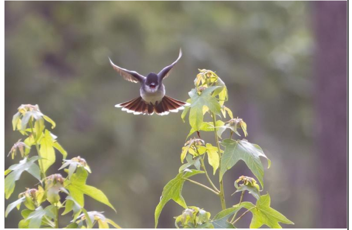
Eastern Kingbird ( Tyrannus tyrannus )