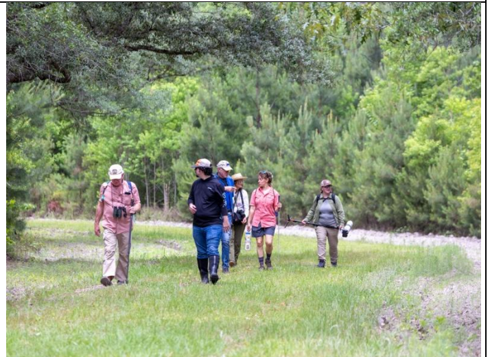
Sodding at Blessing Plantation