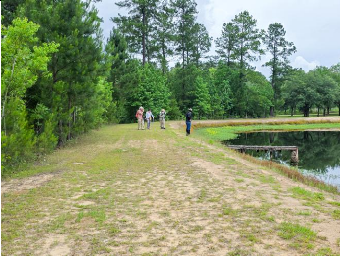
Strolling the pond bank at Blessing Plantation