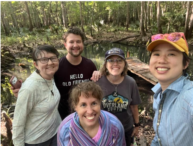
Enjoying Blue Springs