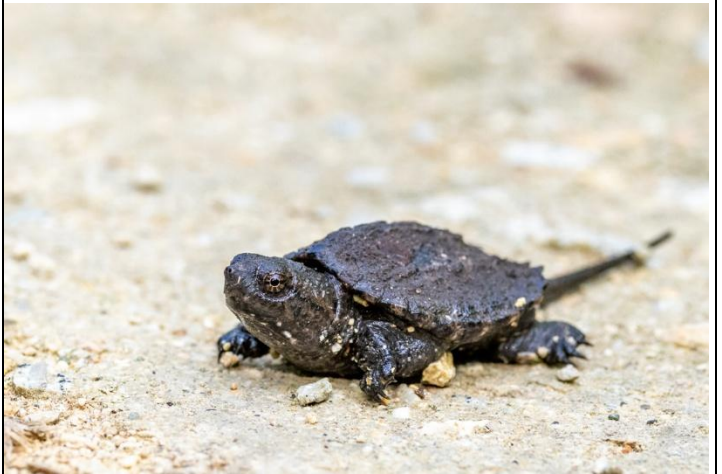
Common Snapping Turtle ( Chelydra serpentina )