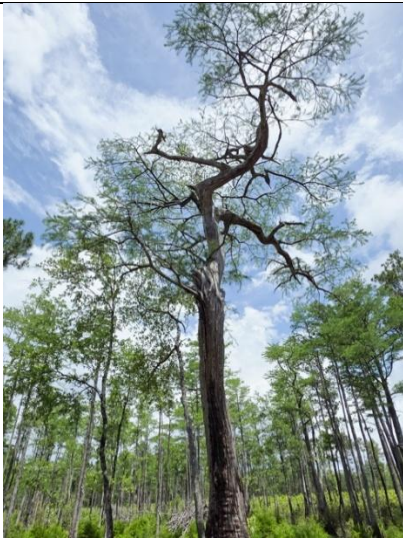
Baldcypress ( Genus Taxodium )