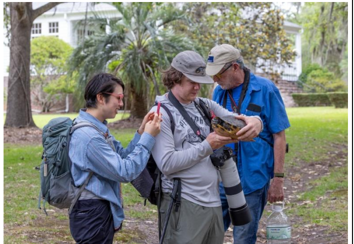
Inspecting a turtle