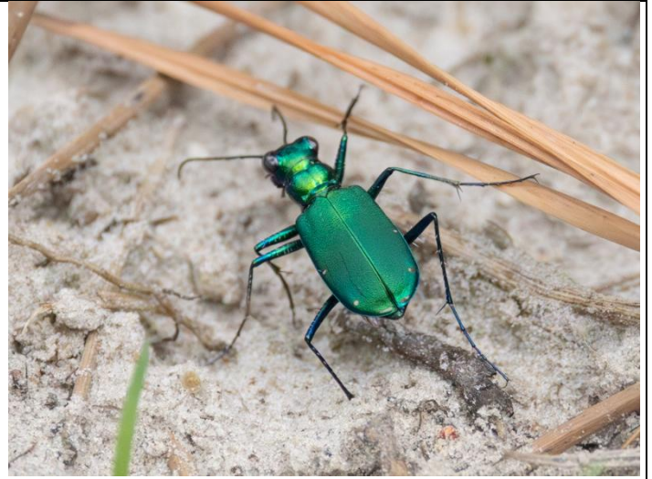
Six-spotted Tiger Beetle ( Cicindela sexguttata )