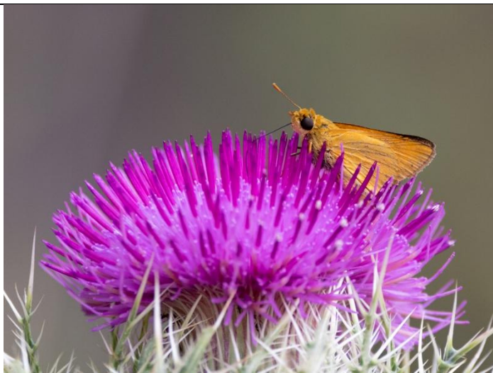
Delaware Skipper ( Anatrytone logan )