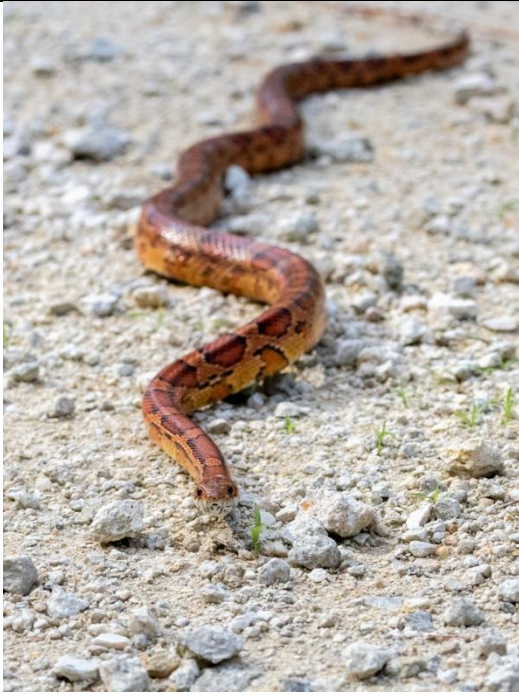
Red Cornsnake ( Pantherophis guttatus )