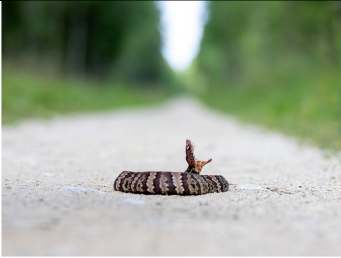
Northern Cottonmouth ( Agkistrodon piscivorus )