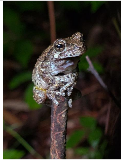
Cope's Gray Tree Frog ( Dryophytes chrysoscelis )