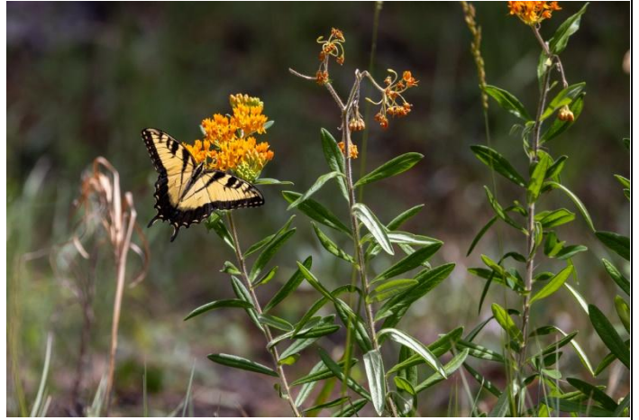
Eastern Tiger Swallowtail ( Papilio glaucus )