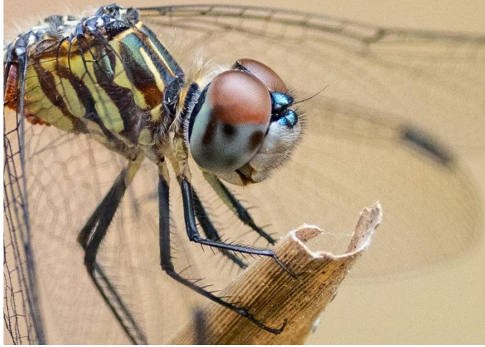
Blue Dasher ( Pachydiplax longipennis )