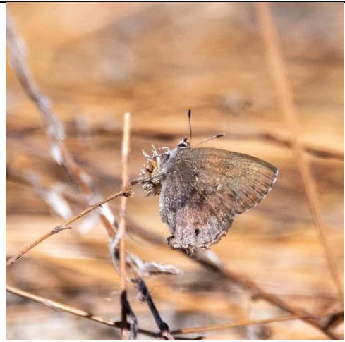
Frosted Elfin ( Callophrys irus ) Kim McManus