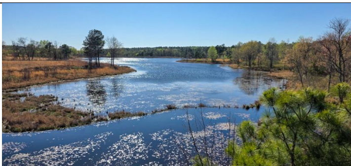
Water feature Kim McManus