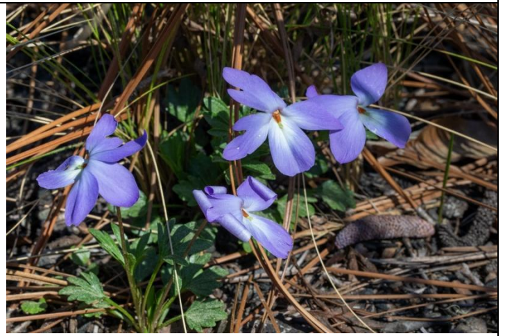
Bird's Foot Violet ( Viola pedata ) Kim McManus