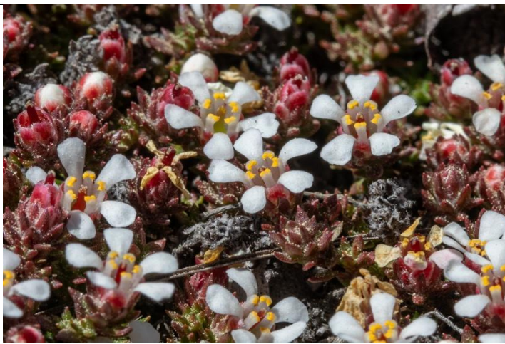
Sandhill Pyxiemoss ( Pyxidantha brevifolia)