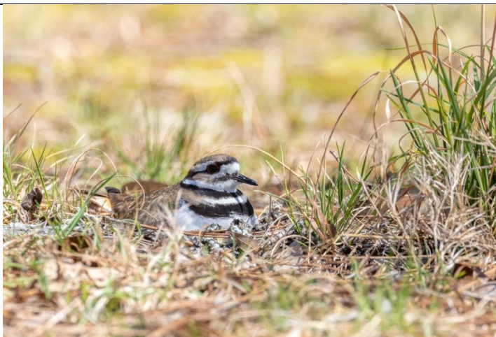
Killdeer ( Charadrius vociferus ) Kim McManus