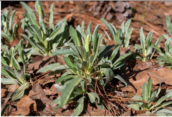
Skyblue Lupine ( Lupinus diffusus)