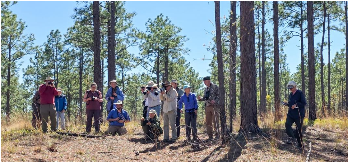
Documenting the endangered Frosted Elfin