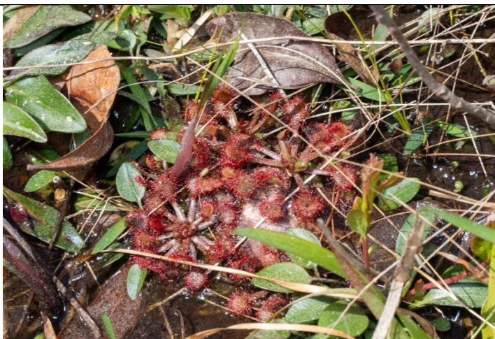
Pink Sundew ( Drosera capillaris)