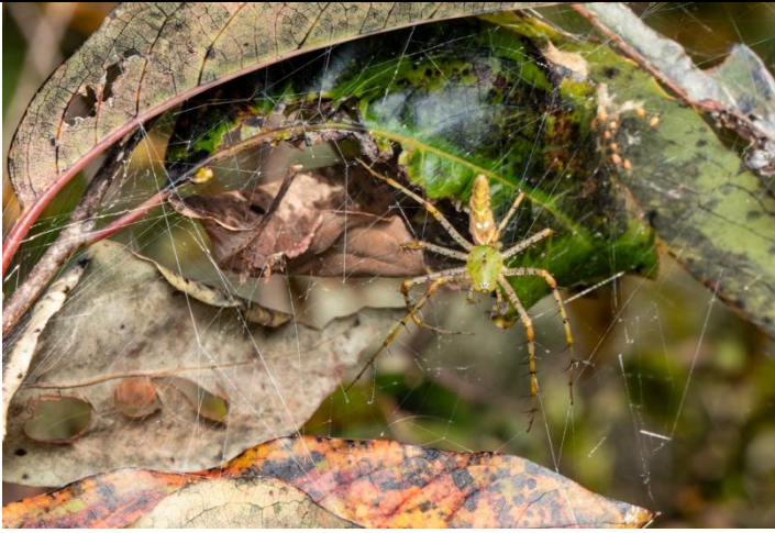
Green Lynx Spider ( Peucetia viridans)