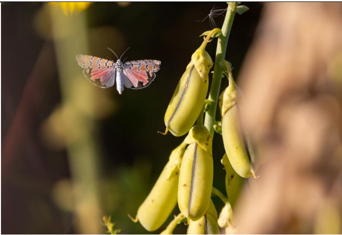
Ornate Bella Moth ( Utetheisa ornatrix)