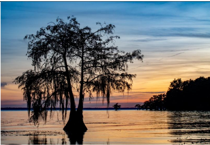
Sunset over Lake Marion