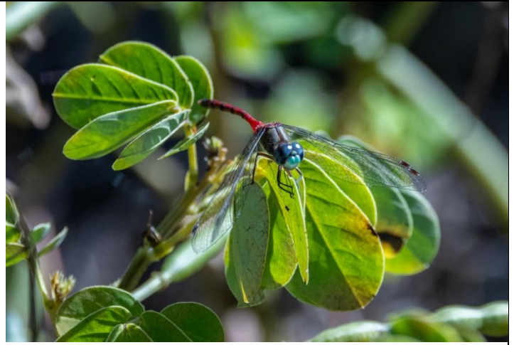
Blue-faced Meadowhawk ( Sympetrum ambiguum)