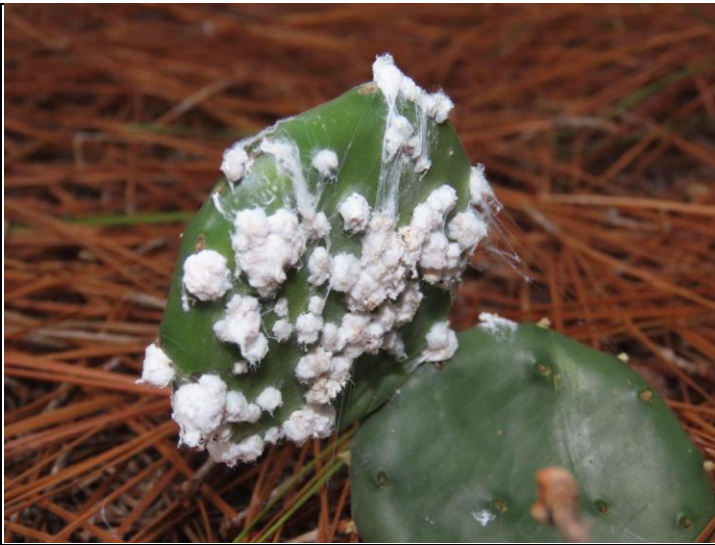
American Cochineal Bugs ( Dactylopius coccus ) on Eastern Prickly-Pear ( Opuntia humifusa )