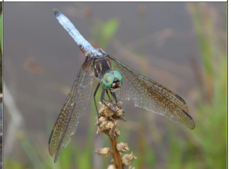
Blue Dasher ( Pachydiplax longipennis )