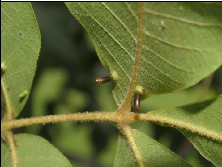
Hickory Tube Gall Midge ( Caryomyia tubicola )