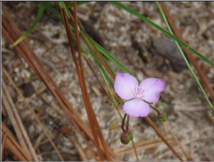
Grassleaf Roseling ( Callisia graminea )