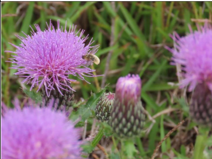
Woolly Bee Fly ( Systoechus sp.) on Sandhill Thistle ( Cirsium repandum )