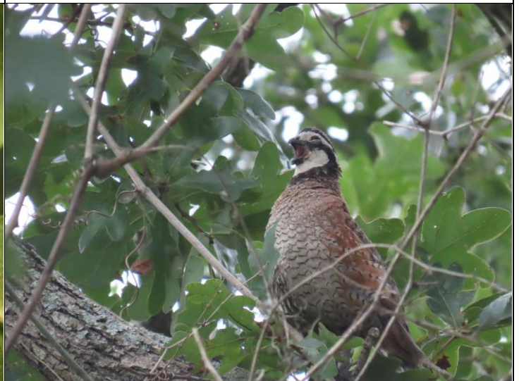
Bobwhite ( Colinus virginianus ) just a whistlin' his heart out.