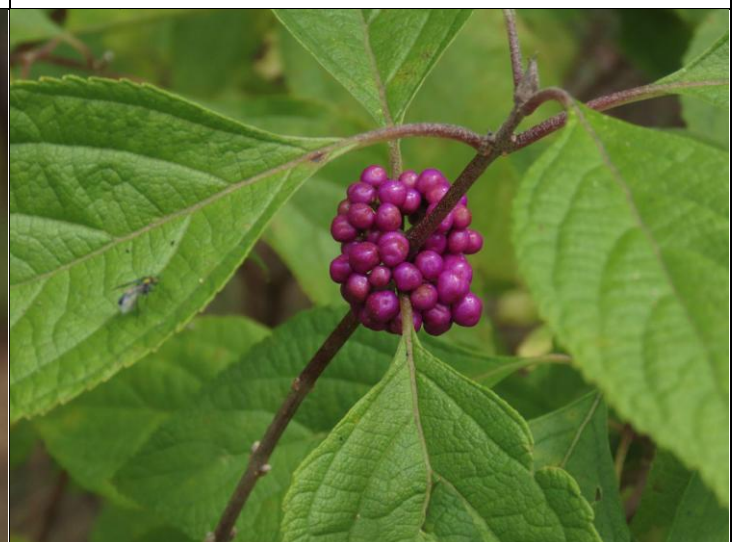
American Beautyberry ( Callicarpa americana )