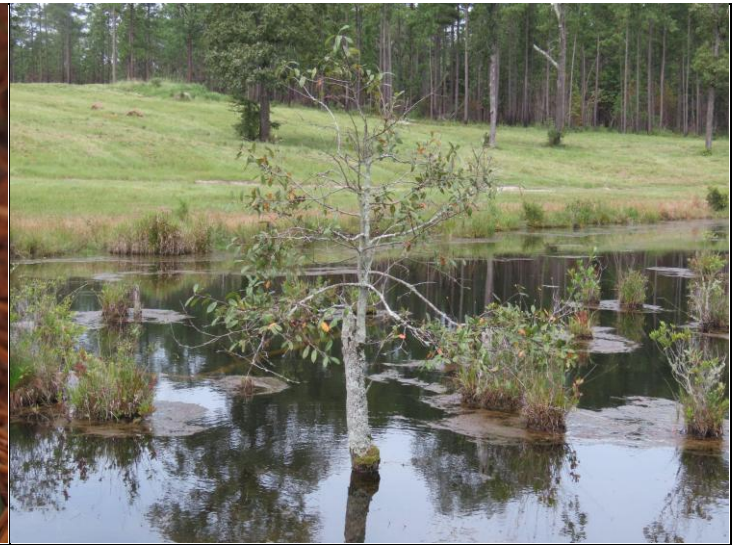
Swamp Tupelo ( Nyssa biflora )