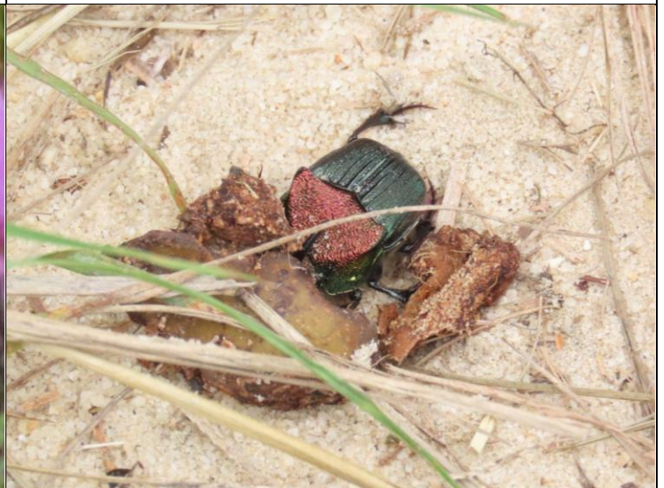
Rainbow Scarab ( Phanaeus vindex )