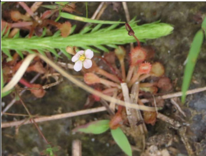
Pink Sundew ( Drosera capillaris )