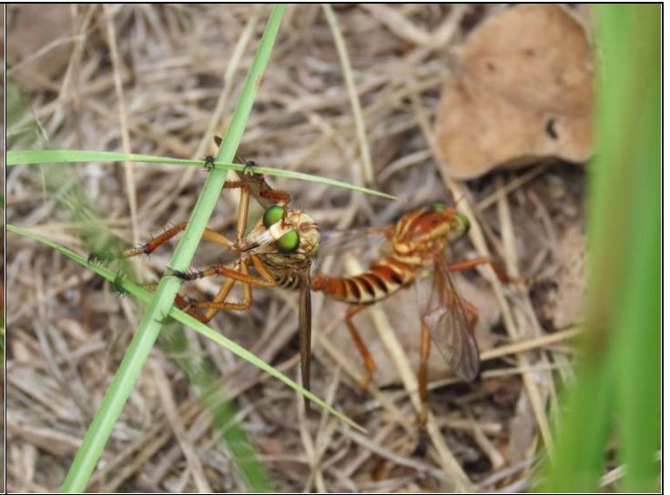
Hanging Thieves ( Diogmites crudelis ) hanging out.