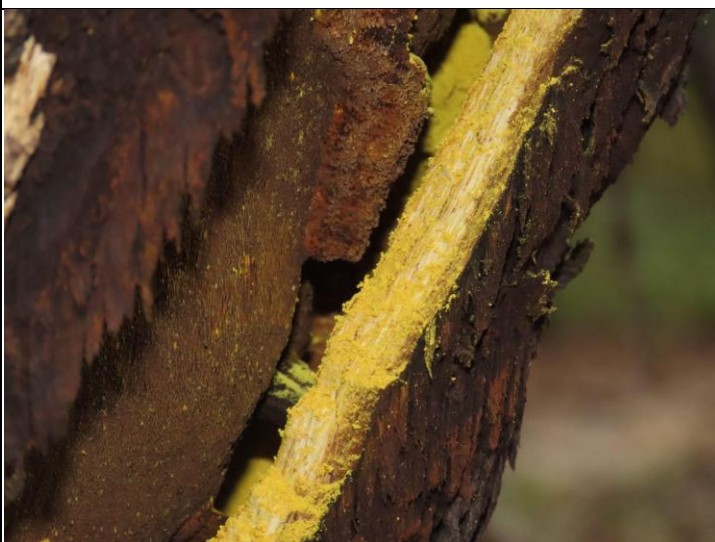
Gold Dust Lichen ( Chrysothrix sp.)