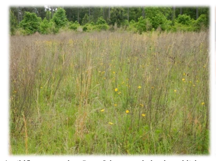
A wildflower meadow Dave Schuetrum helped establish.