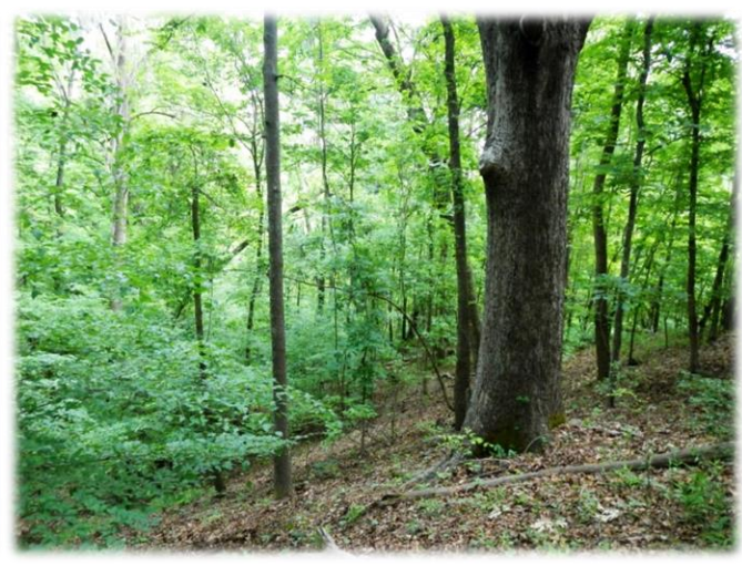
There were some big trees out there, this oak was Over 200 years old!