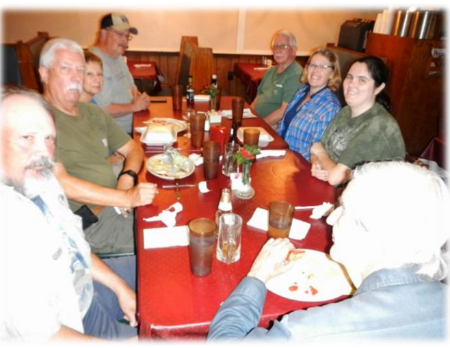
St. Matthews House of Pizza welcomed us for dinner!