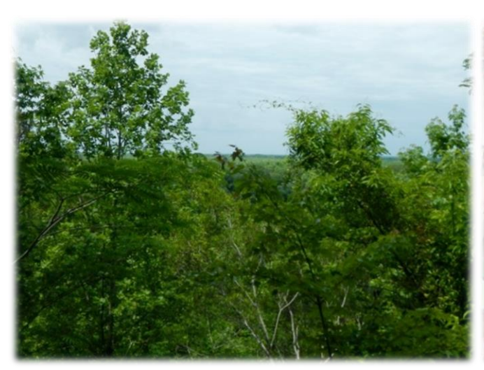
Glimmers of the horizon beyond the bluff.