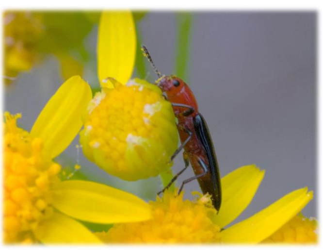
Clover Stem Borer Languria mozardi on Butterweed.