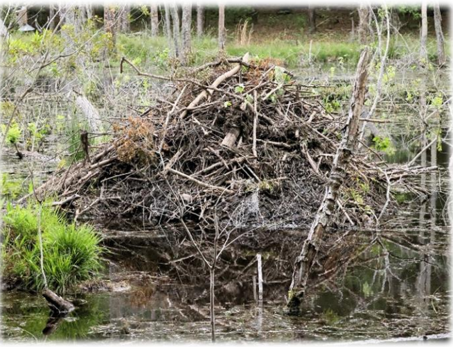
Quite the mansion of a Beaver lodge!