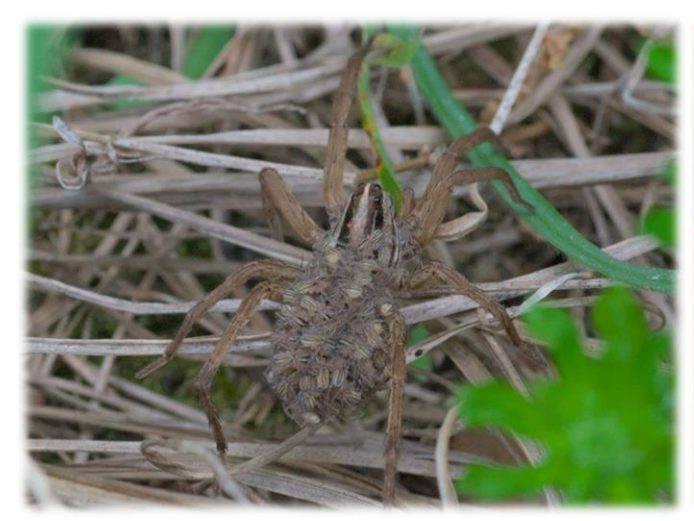
Wolf Spider Rabidosa sp. with her young 'uns.