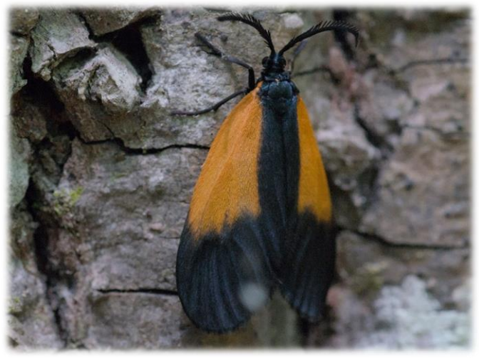
Black-and-Yellow Lichen Moth Lycomorpha pholus .