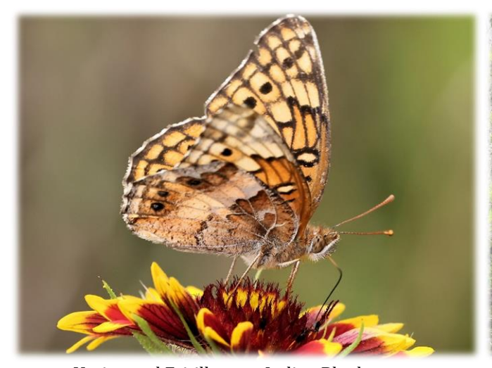
Variegated Fritillary on Indian Blanket.