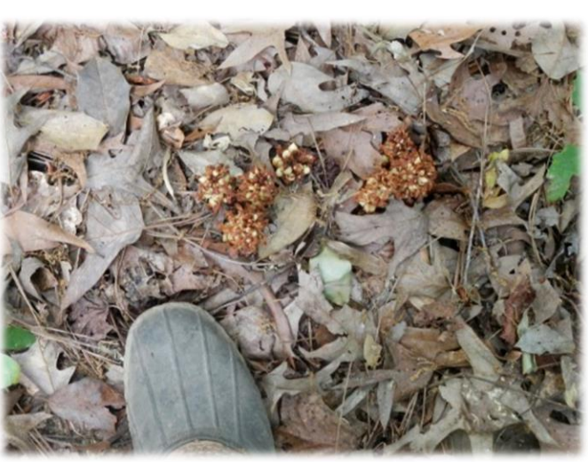
Bear-Corn Conopholis americana in the leaf litter.