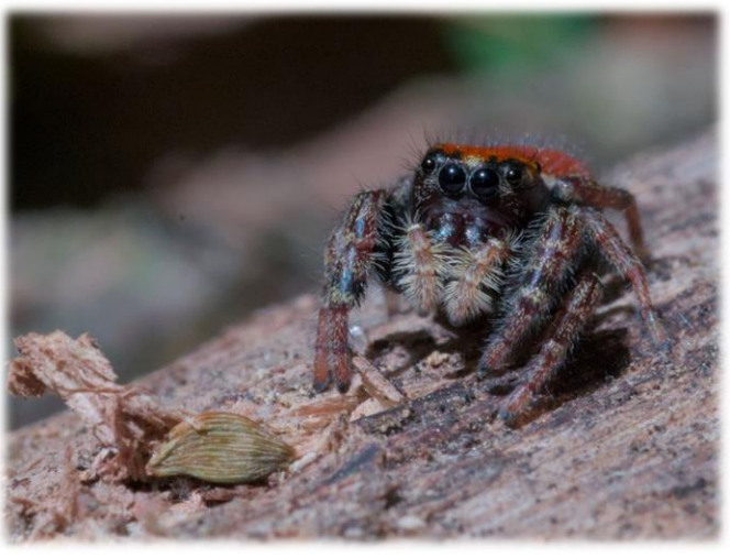
Whitman's Jumping Spider Phidippus whitmani .