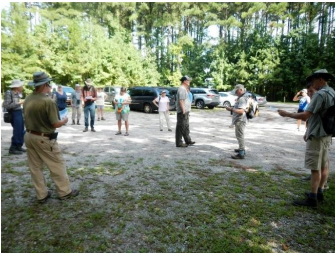
This Heritage Preserve adjoins the 12,000 Year History Park next door and trails lead to both. There is a lot of territory to cover as well as the River Trail along the Congaree River nearby. It goes for miles. The HP was originally the Guignard clay quarry earlier in the century. The clay was mined for bricks.