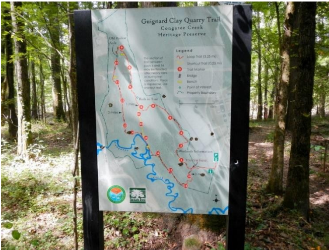
Some of the trail system.