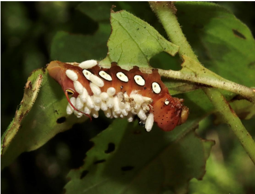
Pandora Sphinx Moth caterpillar ( Eumorpha pandorus) with Braconid parasitic wasp cocoons.