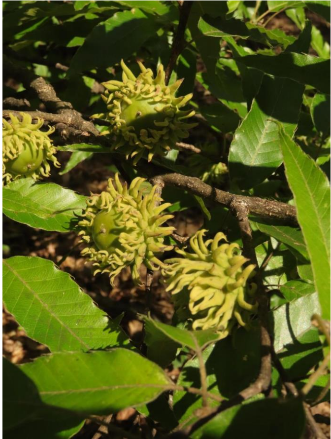
L: An American Giant Millipede ( Narceus americanus) and a Brown-Hooded Cockroach ( Cryptocercus punctulatus) trapped in pooling resin. R: Sawtooth Oak ( Quercus acutissima)