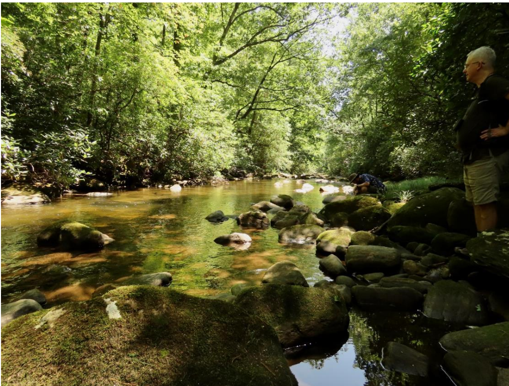
Whitewater River