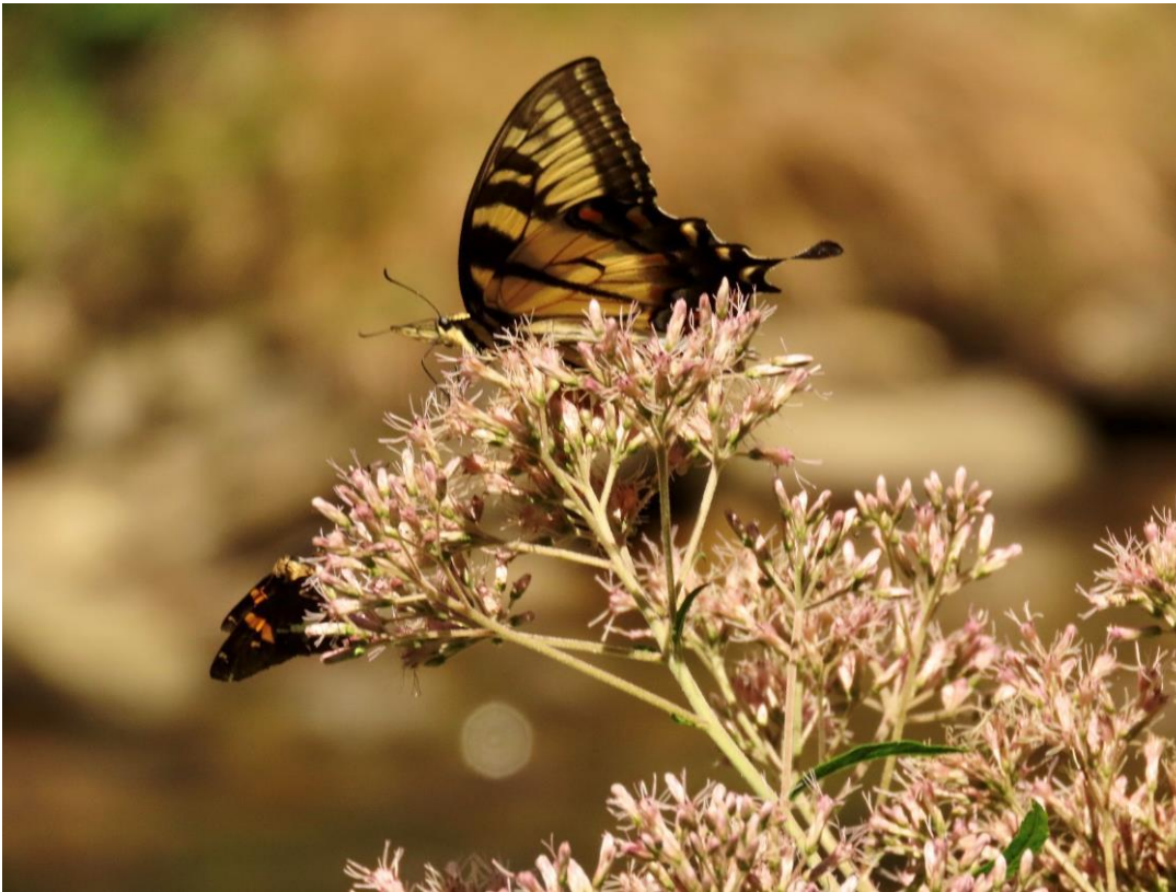
Hollow Joe-Pye Weed ( Eutrochium fistulosum ) with an Eastern Tiger Swallowtail ( Papilio glaucus ) and a Silver-Spotted Skipper ( Epargyreus clarus ). (Lee Morris)