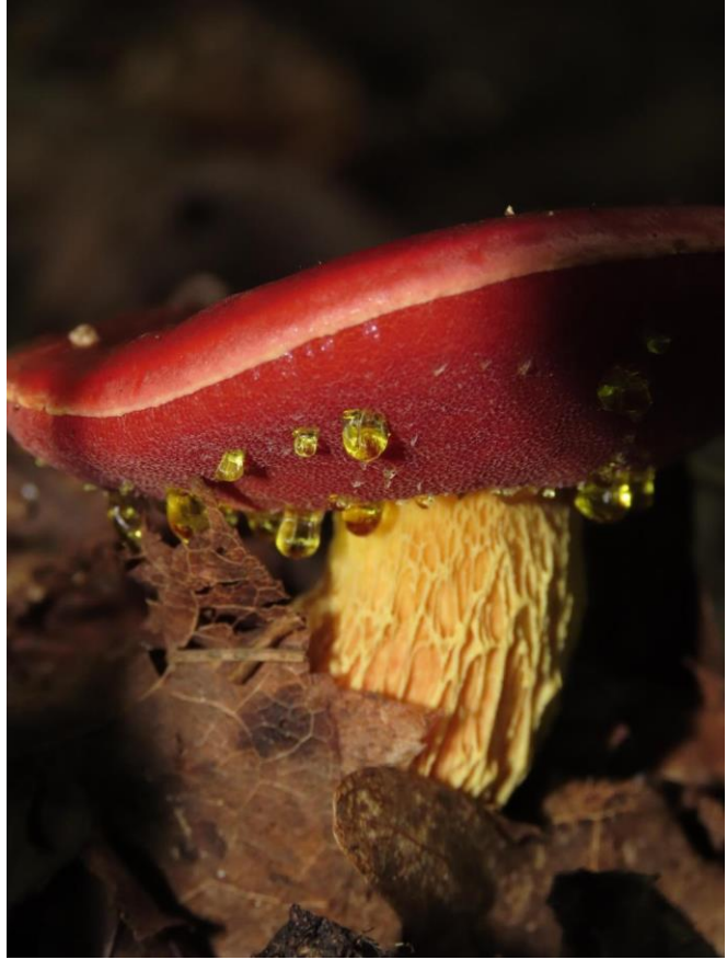
L: Rita cooling off in the Whitewater River. R: Frost's Bolete mushroom ( Exsudoporus frostii ) (Lee Morris)