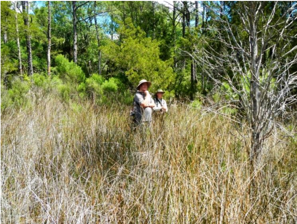
The tide was out and the marsh sure looked inviting.