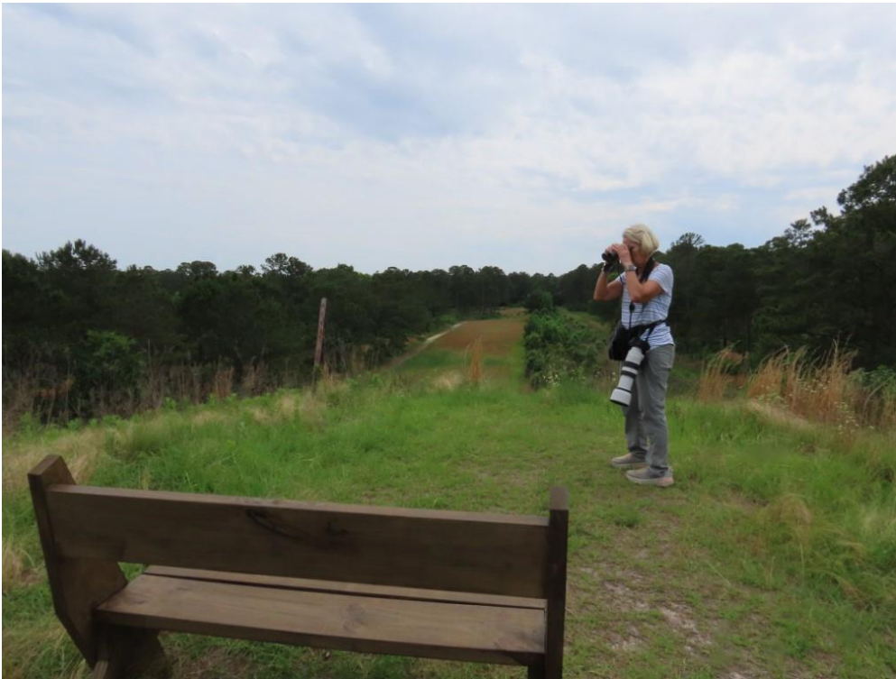
The view from atop Star Mountain.