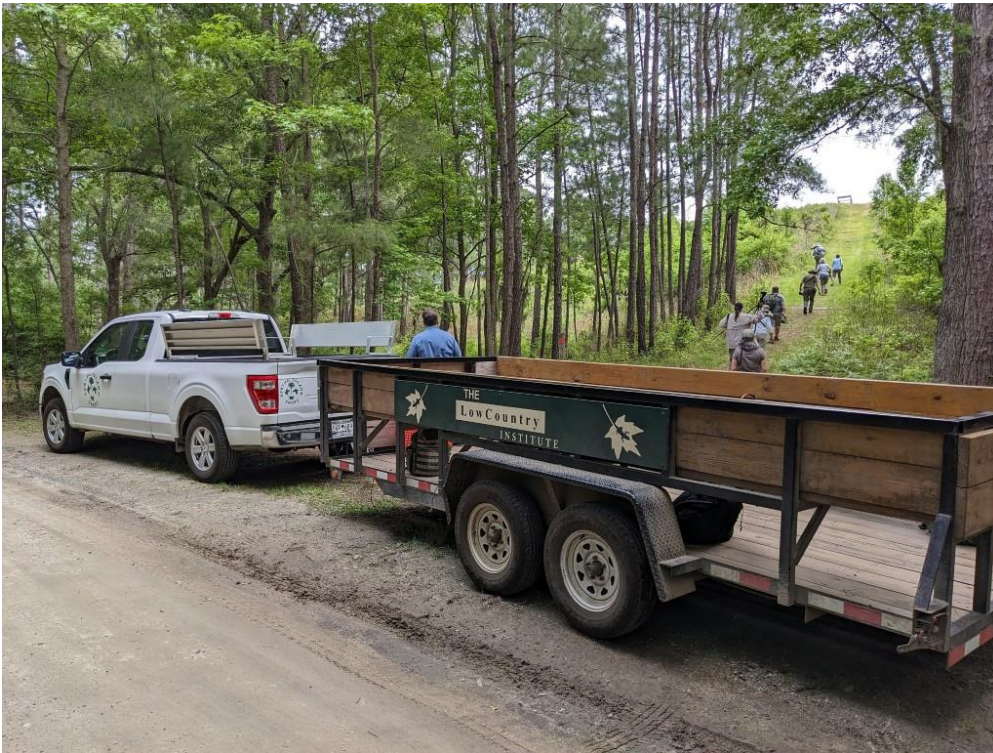
Our trusty steed for the day.