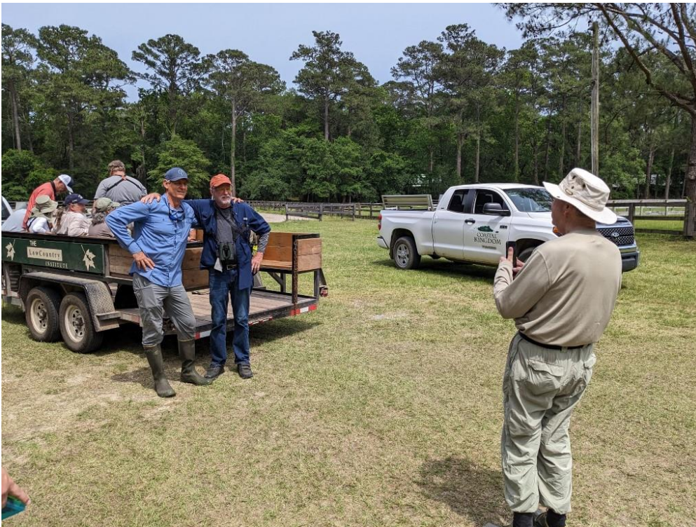
Star-struck SCANNers posing with local TV star Tony Mills.