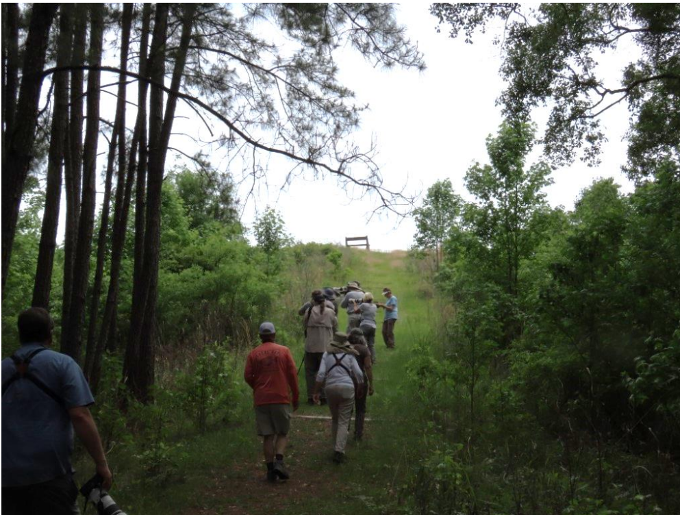
The group ascending Star Mountain.