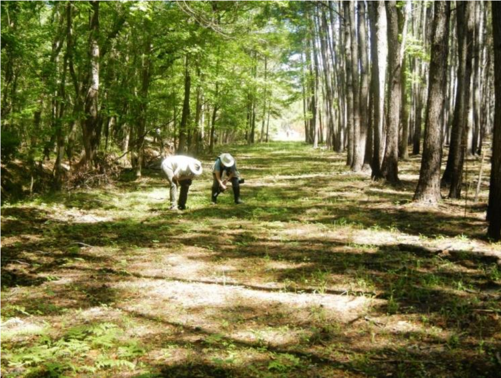
I don't know what it was...