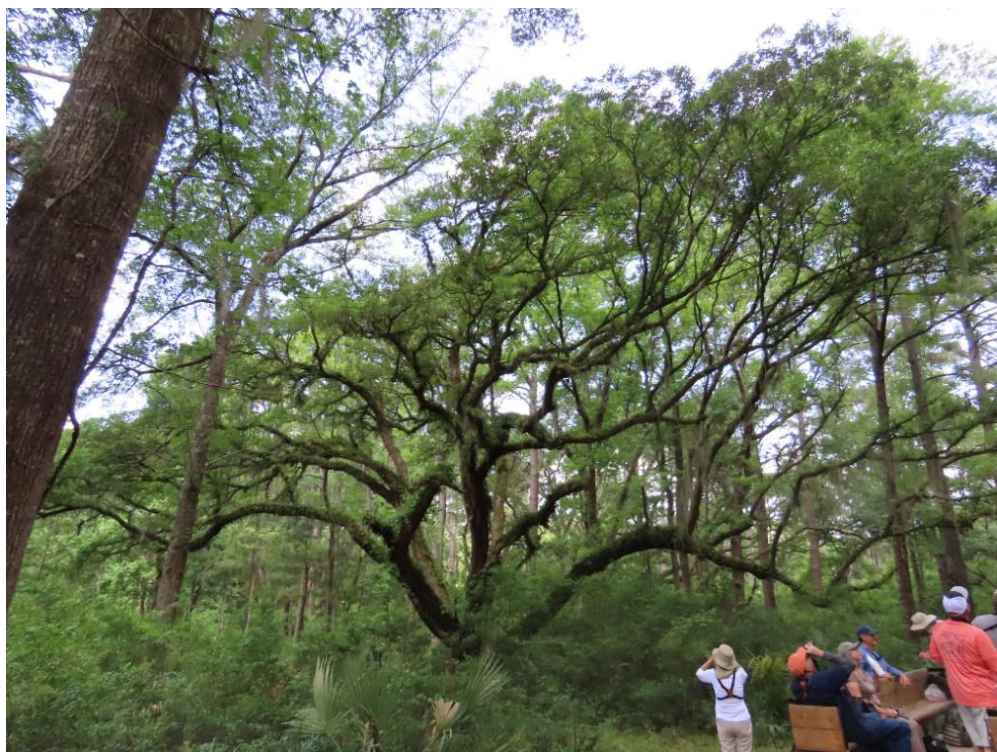
Bird watching beneath the Live Oaks.