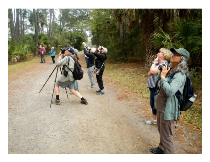
I don't know what it was...but it collected the birders.