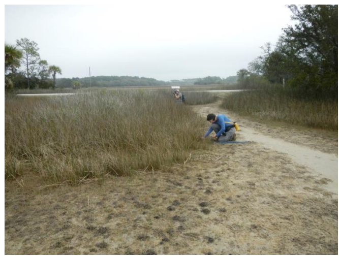
We all spread out. The tide was out and some of us wandered the Salt Pans. Sharon Watson was poking around at something.