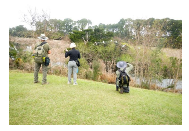
We saw rookeries of Great Blue Herons, Great Egrets, and some Anhingas. They were used to humans gawking.