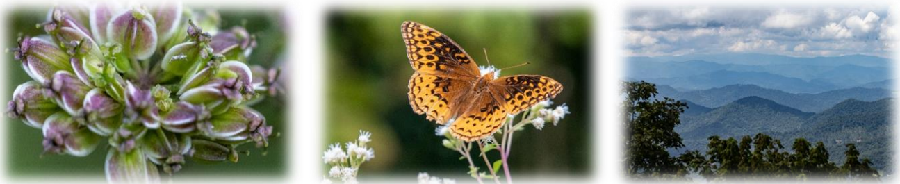
L to R: Mountain Angelica, Great Spangled Fritillary, view from Buck Springs Overlook

Some of the sights I saw along the way included: