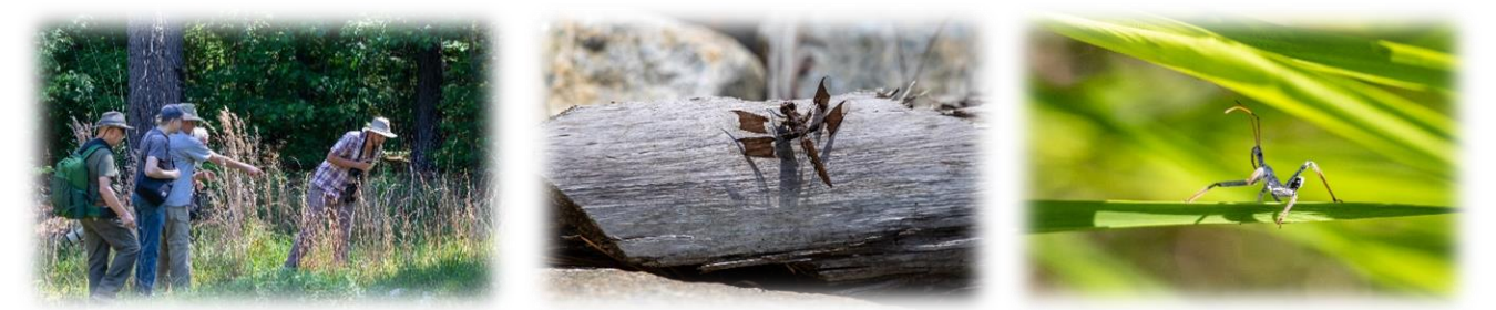
L to R: Spotting a molting Black Racer, female Common Whitetail Skimmer, Wheel Bug nymph

On Saturday, we explored parts of the Awendaw Passage of the Palmetto Trail. The starting point was the Awendaw Canoe Launch at the end of Rosa Green Road. We gathered briefly, then split into two groups. One group stayed in the shade and walked along Awendaw Creek towards Buck Hall Recreation Area, looking mostly for birds. The other group headed inland, looking for open spaces, sunshine and butterflies. After lunch, both groups headed back to the Francis Marion Forest for more road cruising.