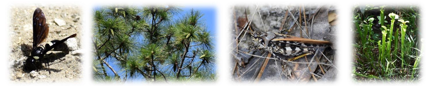
L to R: Four-toothed Mason Wasp, Longleaf Pine, Yellow Pitcher Plants

Thanks to everyone who came out and participated during the weekend! It was a festival of exploration!