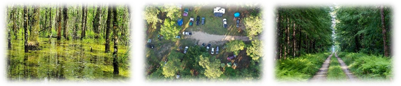
L to R: Coggeshall Swamp, Hell Hole Campground, Hell Hole Road

On Saturday, we explored parts of the Awendaw Passage of the Palmetto Trail. The starting point was the Awendaw Canoe Launch at the end of Rosa Green Road. We gathered briefly, then split into two groups. One group stayed in the shade and walked along Awendaw Creek towards Buck Hall Recreation Area, looking mostly for birds. The other group headed inland, looking for open spaces, sunshine and butterflies. After lunch, both groups headed back to the Francis Marion Forest for more road cruising.