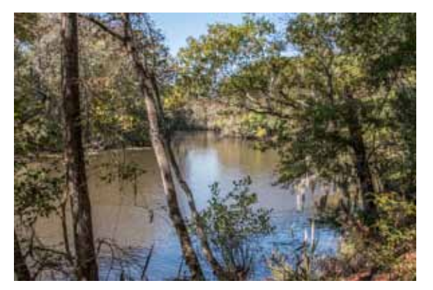
Little Bull Creek